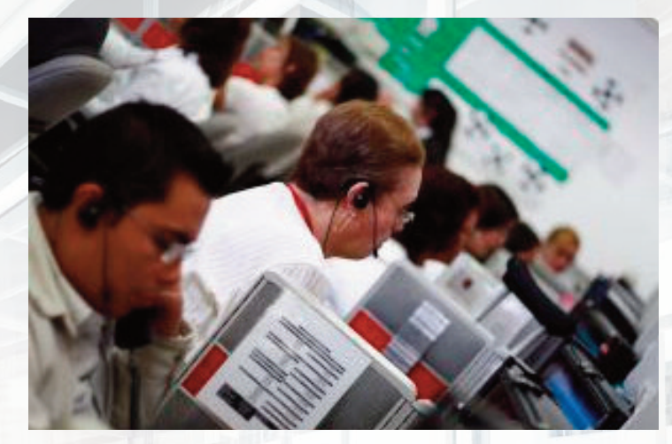
Monitored Access Control - Our team of professionals will keep your business safe by monitoring activities 24/7.